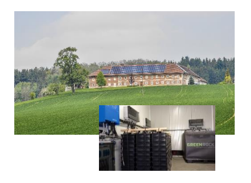
Jürgen Hutsteiner, farmer, Steyr, Austria

Our GREENROCK storage system combined with a photovoltaic system reaches nearly 100% self-sufficiency in summer. Thanks to island function, air conditioning, lighting and operating systems are working even in the event of a black-out. Our animals are well tended to and never in danger.