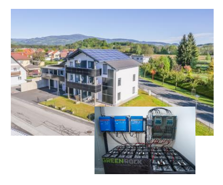
Paul Langmann, Langmann Consulting Frauental, Austria

The project arose from the idea of supplying a multi-family house with solar energy. Large photovoltaic areas provide energy which is converted into electricity and heat. The power storage serves as buffer storage when the sun is not shining. With GREENROCK we found an economical solution with maximum safety.